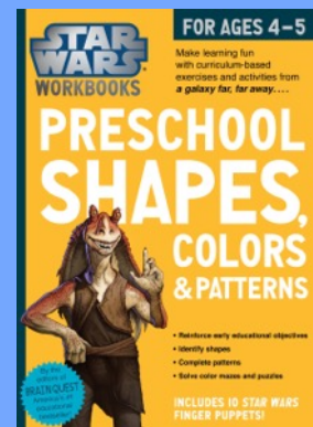
Star Wars Workbook: Shapes, Colors, and Patterns, by Workman Publishing