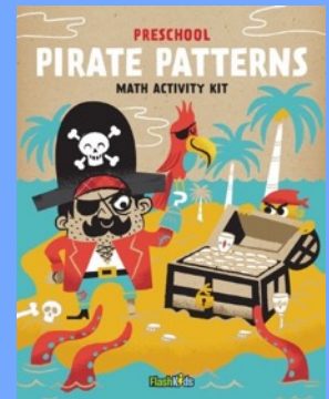
Pirate Patterns: Math Activity Kit, by Flash Kids