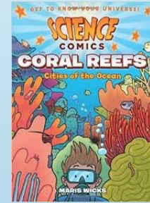
Coral Reefs: Cities of the Ocean , Maris Wicks